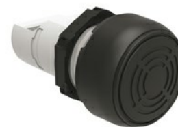
Monoblock buzzer - Continuous or pulse tone LPCZS